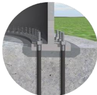
Shallow trench design