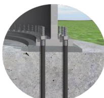
Above plinth design